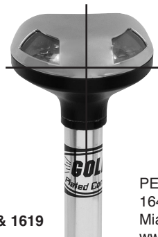
Figs. 1617 & 1619